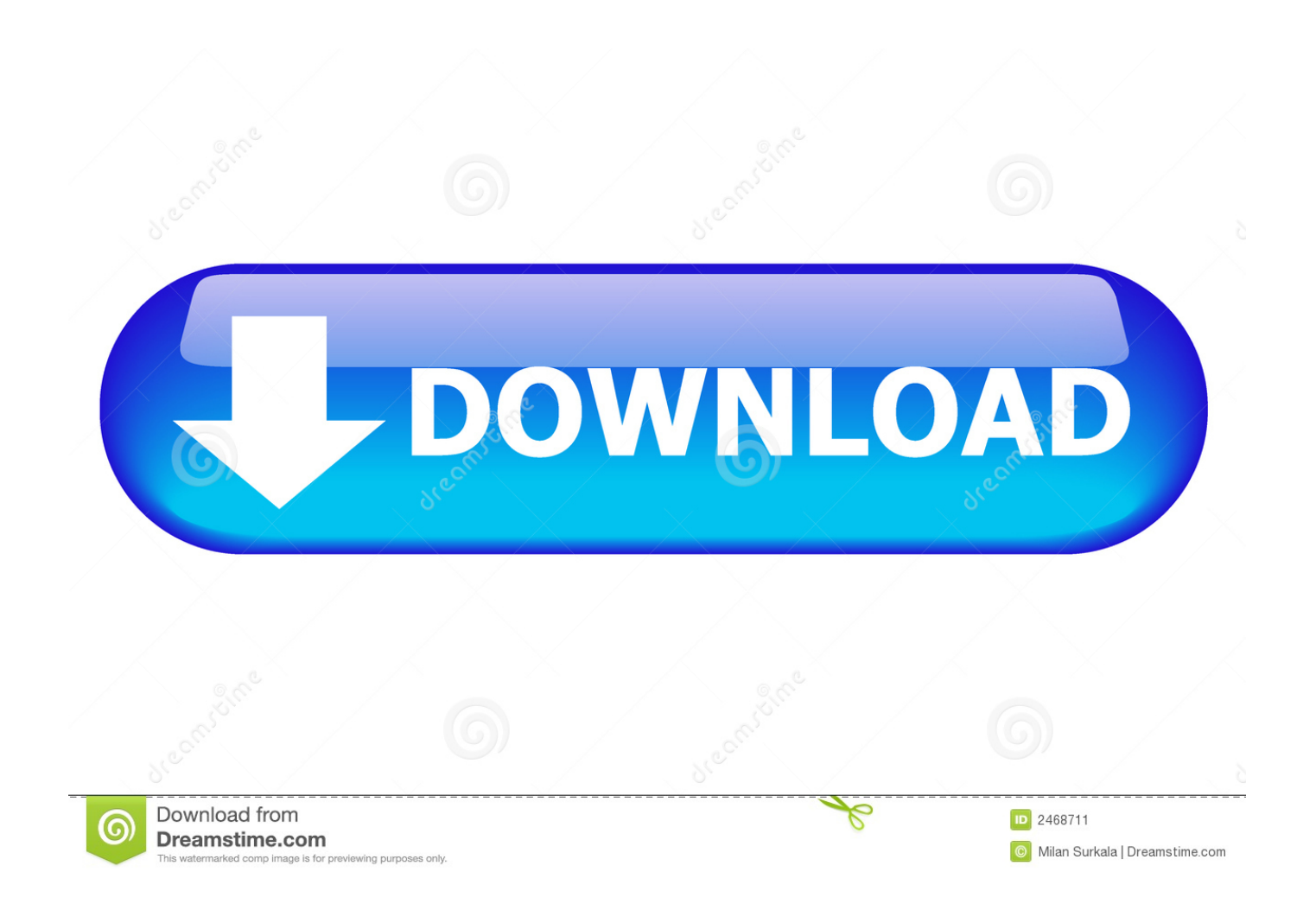
Crysis 3 Fixer 103 Download